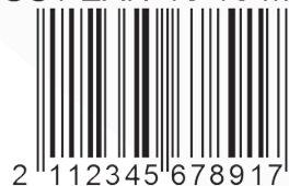
GS1 EAN-13 13 mil